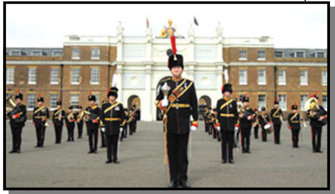
The spectacular Royal Artillery Band at Woolwich Barracks, London

He joined the Commissionaires in 2006 and currently works as a spare, primarily at Hamilton Federal Building.